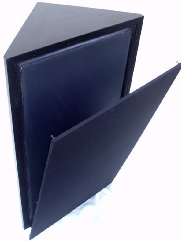
The Dimension4 SpringTrap. Notice the gasket-sealed diaphragm behind the removable grille.

SpringTrap is 46"x18"x18" and it can be painted to any color.